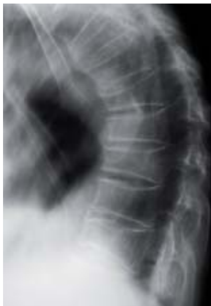
Spinal osteoporotic fractures.